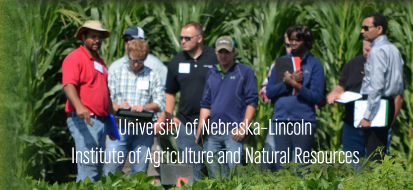
University of Nebraska-Lincoln Institute of Agriculture and Natural Resources